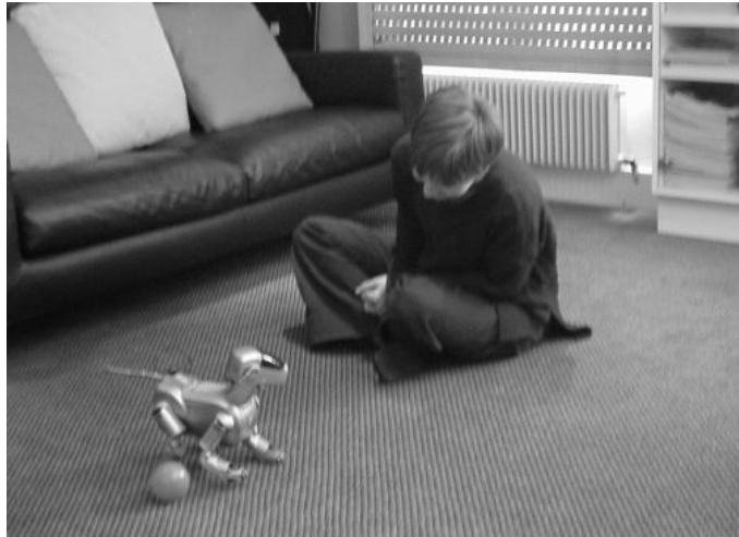
Fig. 3. Test sessions with "naive" users

Although the precise analysis of these sessions are still undergoing, we can already make several general observations.